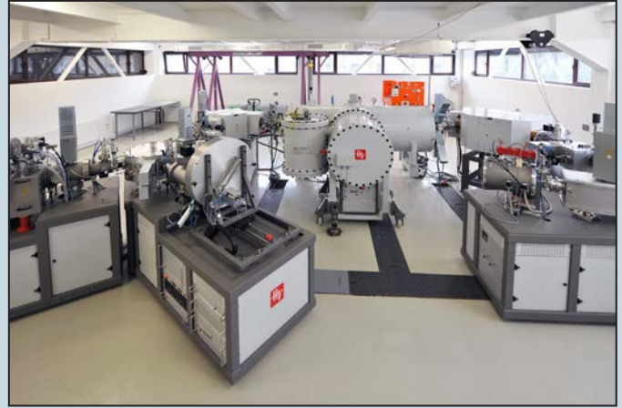
Figure 2. An Accelerator Mass Spectrometry (AMS) system with a 1 MV Tandem Accelerator at IFIN-HH